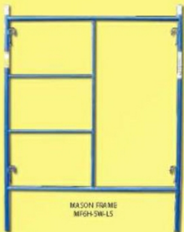
MASON FRAME MF6H-5W-L5